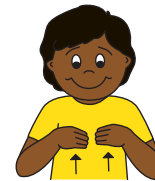
blanket Hold hands low, palms facing your body, and thumbs tucked. Pull hands to chest level as if pulling a blanket up over your body.