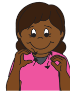
bubbles Make O sign with each hand. Alternating hands, move them up and down, opening and closing fingers like popping bubbles.